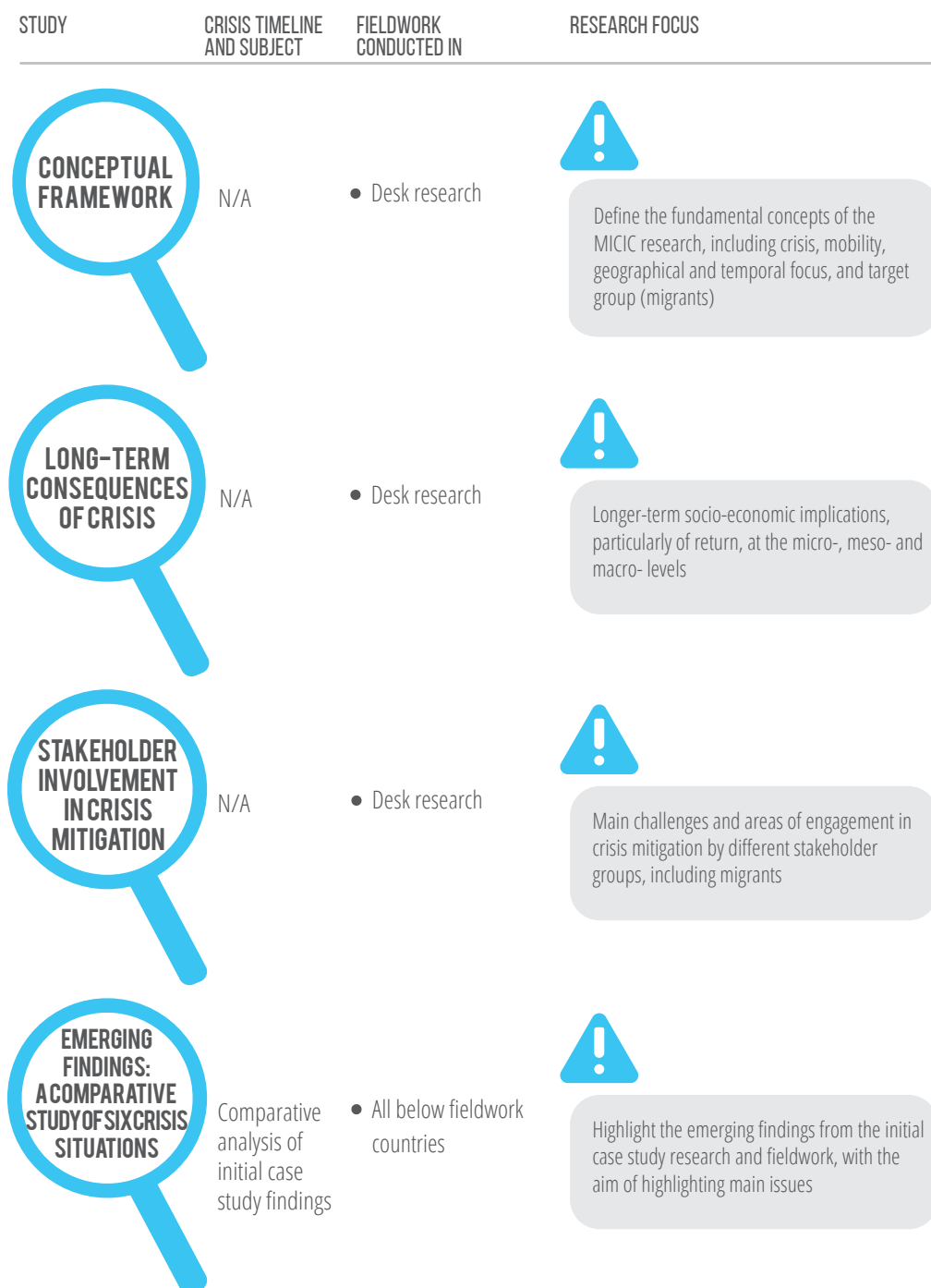
Table 1 MICIC research studies 7