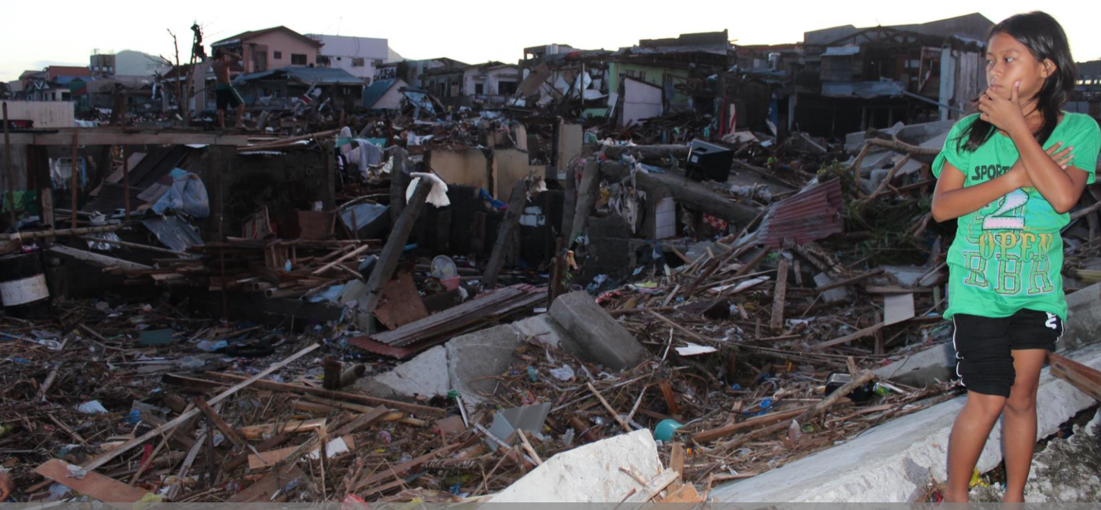
A young girl stands near the devastation of the central Philippine city of Tacloban.

IOM and UNHCR have recently resettled to Europe a victim of Eastern African origin trafficked in Central Africa. Victims of Asian origin trafficked in Western Africa initially rescued by IOM have been assisted to apply for asylum with UNHCR. In addition, IOM and UNHCR's anti-trafficking response in the MENA region, in particular, continues to be informed by the tool. In Jordan, for example, IOM and UNHCR have worked together to respond to trafficking risks posed to Syrian refugees, migrants and host communities in the Mafraq locality, which is where the Za'atari refugee camp is located; in North Africa, IOM and UNHCR are currently working to adapt the rapid response screening and referral mechanism outlined in the SOPs to address the vulnerability of migrants rescued at sea. Those found to be in need of asylum are reviewed for refugee status determination by UNHCR.