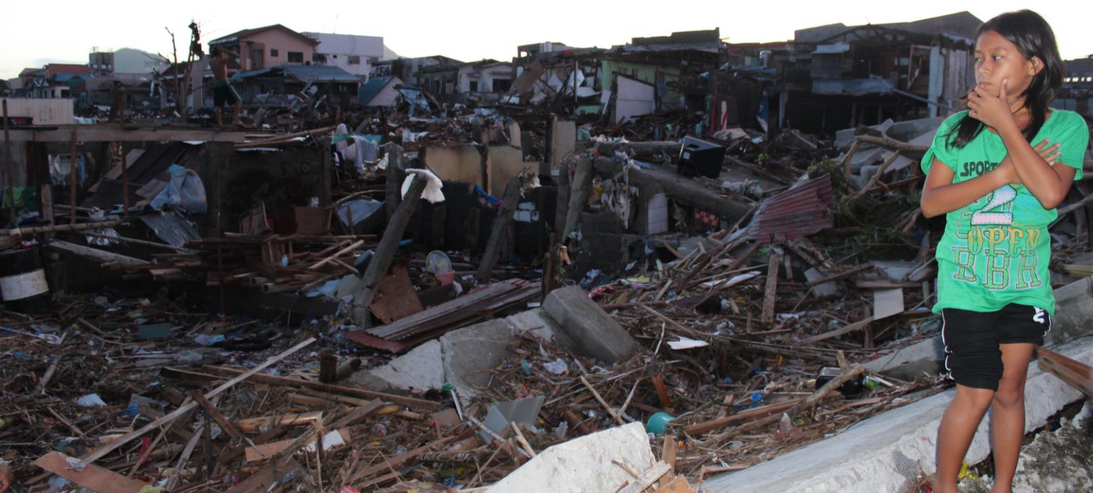
A young girl stands near the devastation of the central Philippine city of Tacloban.

IOM and UNHCR have recently resettled to Europe a victim of Eastern African origin trafficked in Central Africa. Victims of Asian origin trafficked in Western Africa initially rescued by IOM have been assisted to apply for asylum with UNHCR. In addition, IOM and UNHCR's anti-trafficking response in the MENA region, in particular, continues to be informed by the tool. In Jordan, for example, IOM and UNHCR have worked together to respond to trafficking risks posed to Syrian refugees, migrants and host communities in the Mafraq locality, which is where the Za'atari refugee camp is located; in North Africa, IOM and UNHCR are currently working to adapt the rapid response screening and referral mechanism outlined in the SOPs to address the vulnerability of migrants rescued at sea. Those found to be in need of asylum are reviewed for refugee status determination by UNHCR.